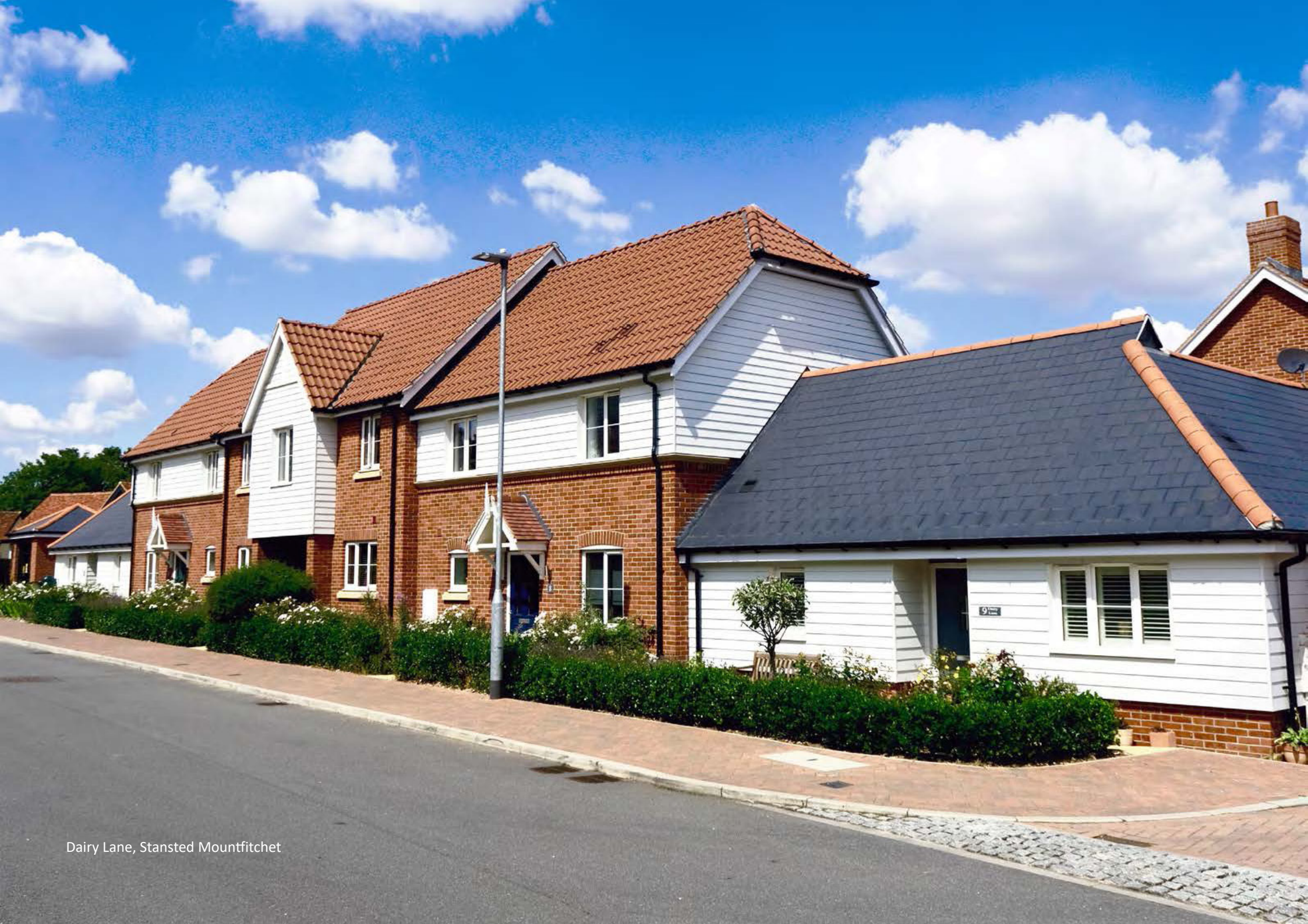
Dairy Lane, Stansted Mountfitchet