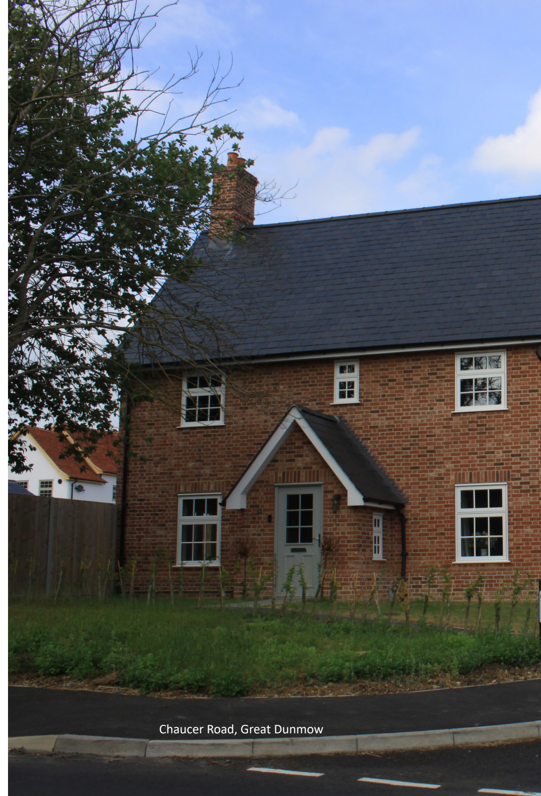
Chaucer Road, Great Dunmow

"133. Local planning authorities should ensure that they have access to, and make appropriate use of, tools and processes for assessing and improving the design of development. These include workshops to engage the local community, design advice and review arrangements, and assessment frameworks such as Building for a Healthy Life 51 . These are of most benefit if used as early as possible in the evolution of schemes, and are particularly important for significant projects such as large scale housing and mixed use developments. In assessing applications, local planning authorities should have regard to the outcome from these processes, including any recommendations made by design review panels."