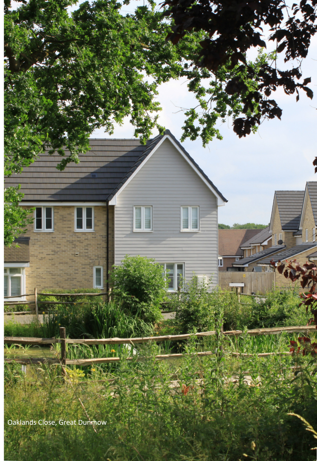
Oaklands Close, Great Dunmow

A Quality Review Panel provides a well-established method of offering independent and impartial guidance on the design of new buildings, landscapes, and public space.