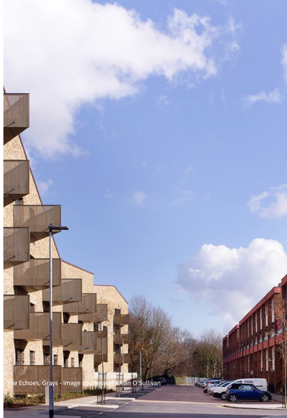
The Echoes, Grays

A Quality Review Panel provides a well-established method of offering independent and impartial guidance on the design of new buildings, landscapes, and public space.