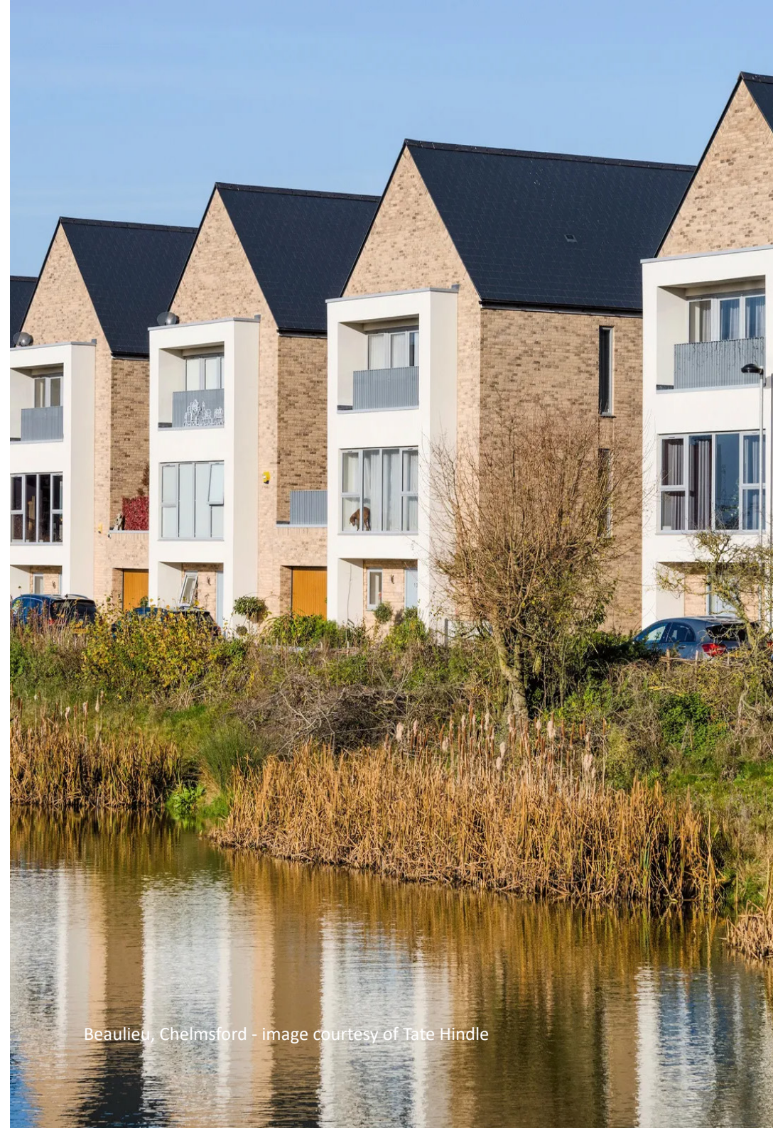
Beaulieu, Chelmsford

For the EQRP to succeed, it must be carried out using a robust, yet transparent and collaborative process. It must also offer consistently high standards in the quality of its advice. These standards can be summarised in the key eleven principles.