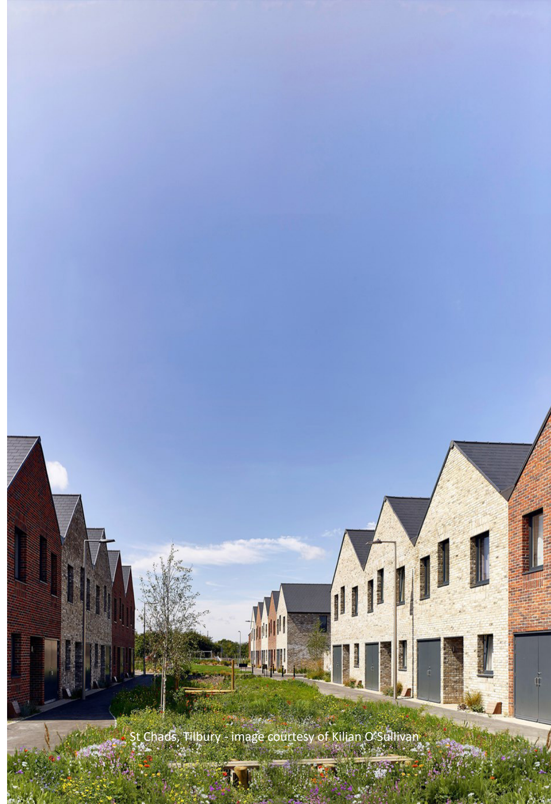
St Chads, Tilbury

“138. Local planning authorities should ensure that they have access to, and make appropriate use of, tools and processes for assessing and improving the design of development. The primary means of doing so should be through the preparation and use of local design codes, in line with the National Model Design Code. For assessing proposals there is a range of tools including workshops to engage the local community, design advice and review arrangements, and assessment frameworks such as Building for a Healthy Life. These are of most benefit if used as early as possible in the evolution of schemes, and are particularly important for significant projects such as large-scale housing and mixed-use developments. In assessing applications, local planning authorities should have regard to the outcome from these processes, including any recommendations made by design review panels.”