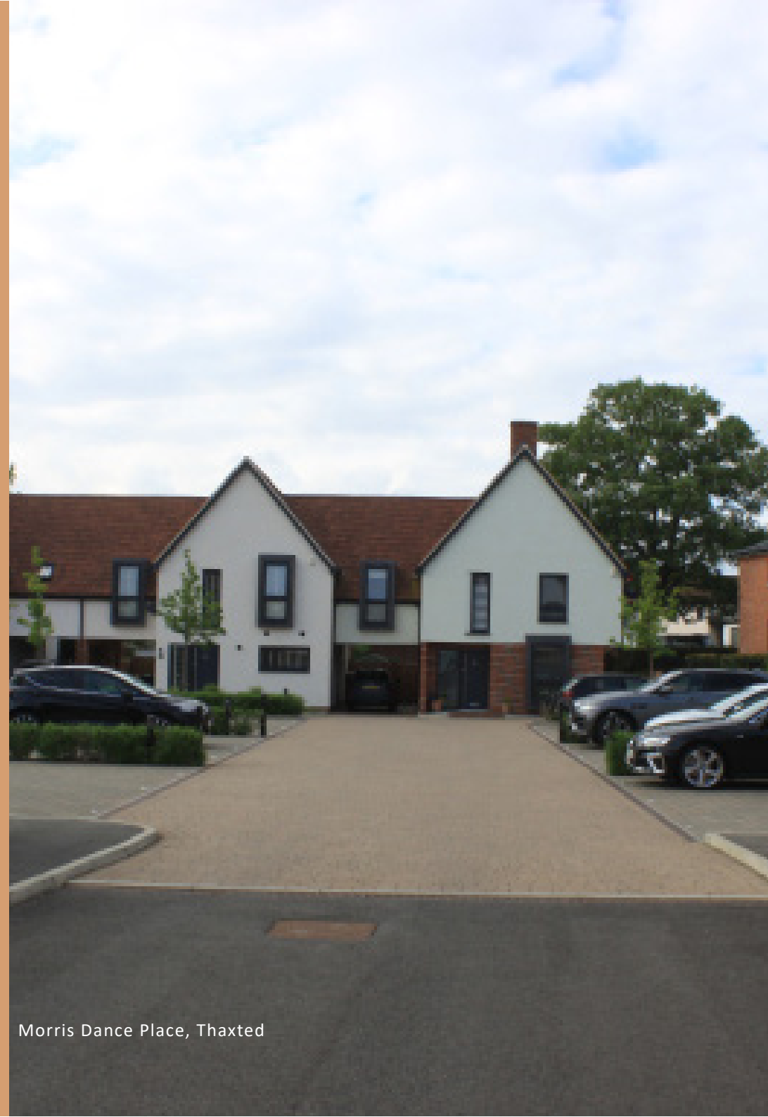
Morris Dance Place, Thaxted

During the formal review session, the LPA case officer will be asked by the Chair to provide a short presentation to further explain the planning and policy context of the project proposal, and what they will be looking for from the review. This should take no more than approximately 20 minutes. Following on from this, there will be a short Q+A session with the panel members to address any queries or clarifications regarding the information provided within the briefing report or case officer's presentation. The panel is open in allowing additional input for other consultees from the LPA to outline specialist concerns if required.