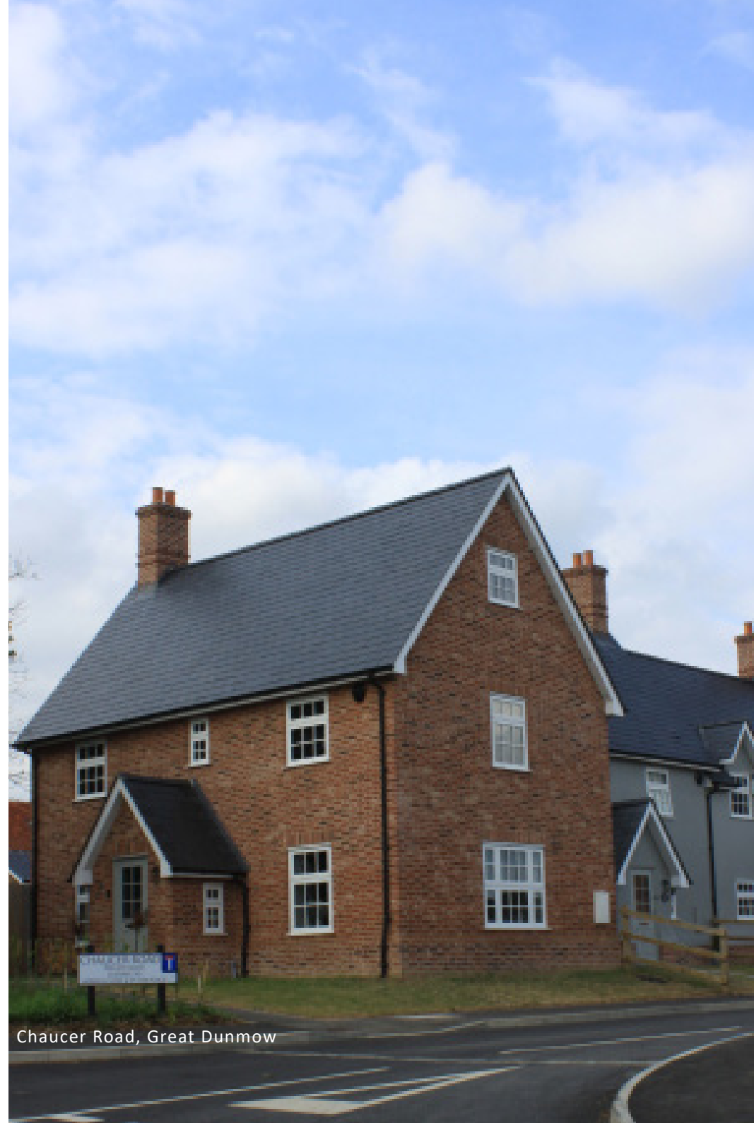
Chaucer Road, Great Dunmow

A briefing report template will be issued to the case officer via the Panel Manager or Coordinator, which will contain topic headings, such as; planning context, description of project, and stage of application. These headings will guide the officer to provide the required background information to the panel members, along with continued support from the UQRP admin team.