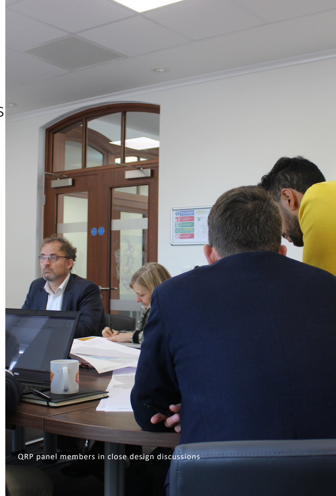
QRP panel members in close design discussions

The Panel management team are happy to discuss applications to assess the need and value a Quality Review Panel would bring to your scheme.