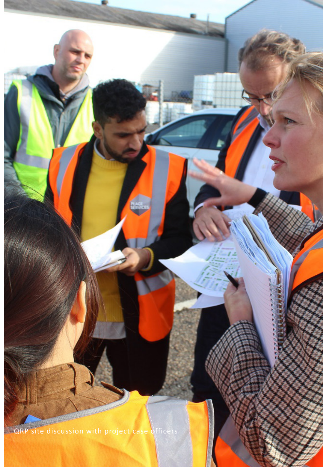
QRP site discussion with project case officers

The fees are set out in the guidance documentation. Cost are usually covered by the applicant, but the Local Authority can use the panel where the benefits will outweigh the cost of the panel itself.