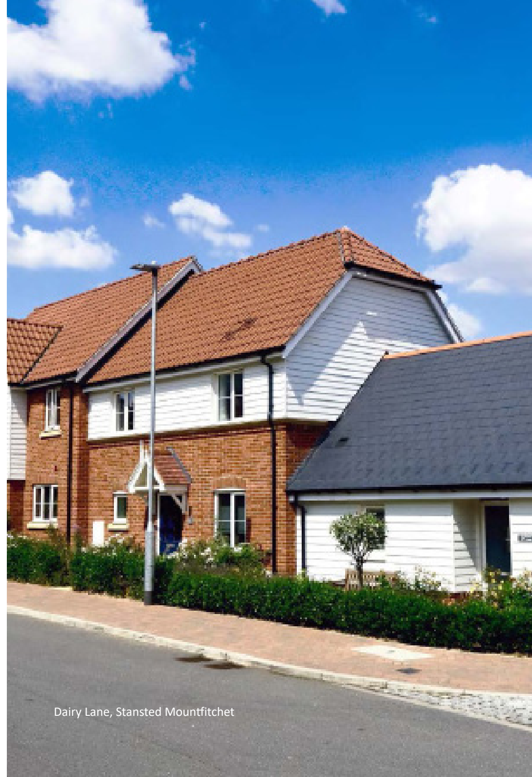
Dairy Lane, Stansted Mountfitchet

“133. Local planning authorities should ensure that they have access to, and make appropriate use of, tools and processes for assessing and improving the design of development. These include workshops to engage the local community, design advice and review arrangements, and assessment frameworks such as Building for a Healthy Life 51 . These are of most benefit if used as early as possible in the evolution of schemes, and are particularly important for significant projects such as large scale housing and mixed use developments. In assessing applications, local planning authorities should have regard to the outcome from these processes, including any recommendations made by design review panels.”