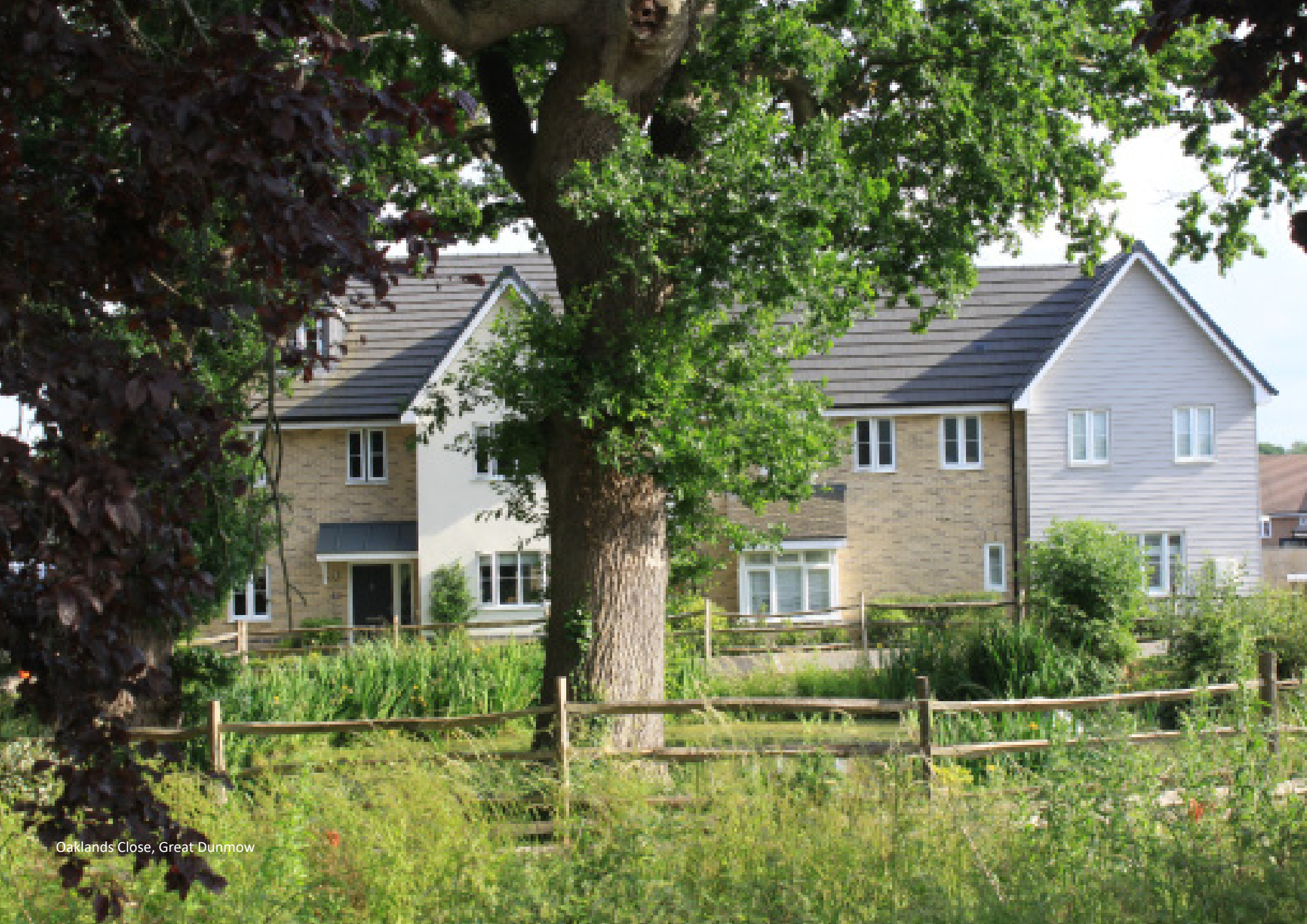
Oaklands Close, Great Dunmow