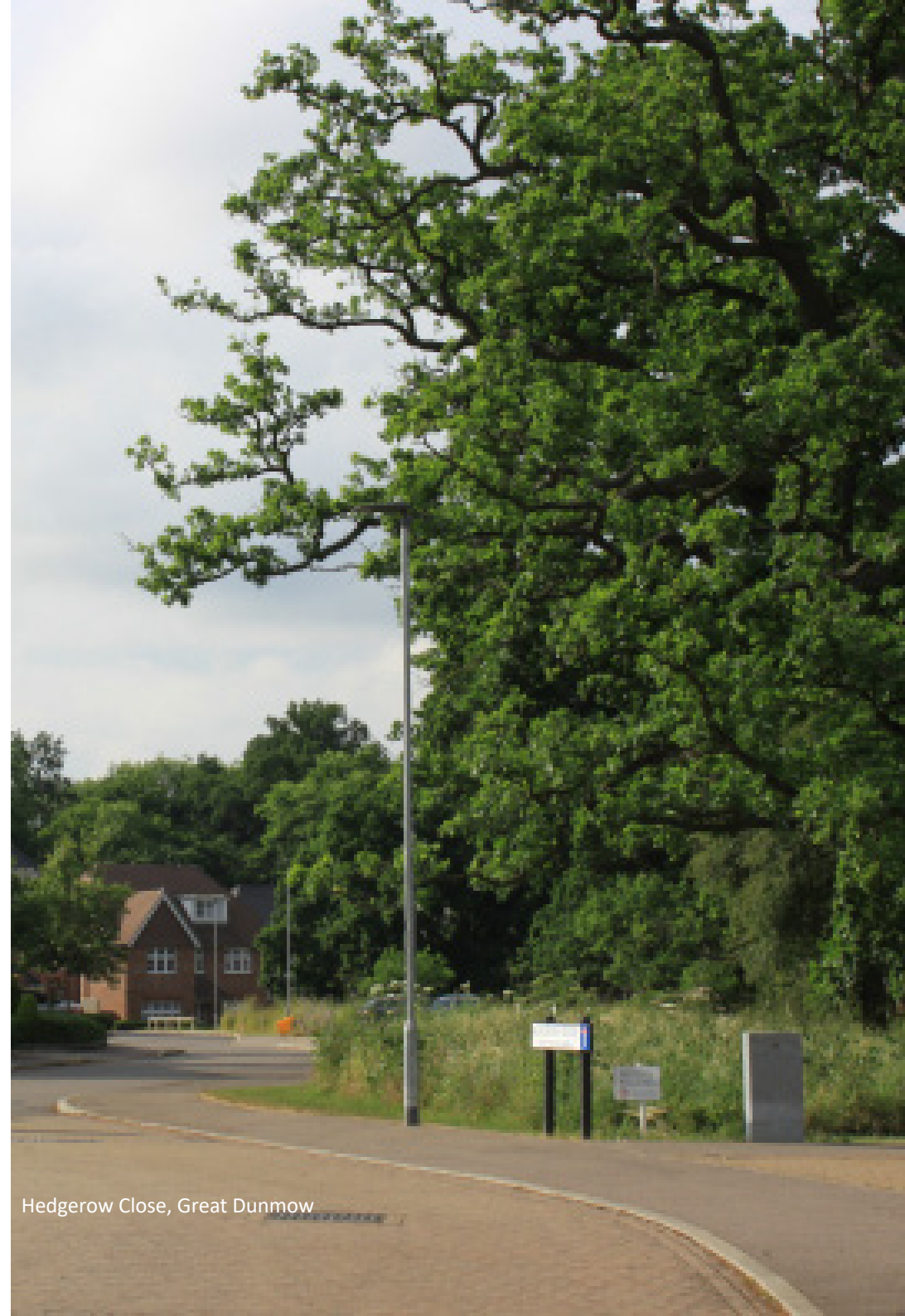
Hedgerow Close, Great Dunmow

A Quality Review Panel provides a well-established method of offering independent and impartial guidance on the design of new buildings, landscapes, and public space.