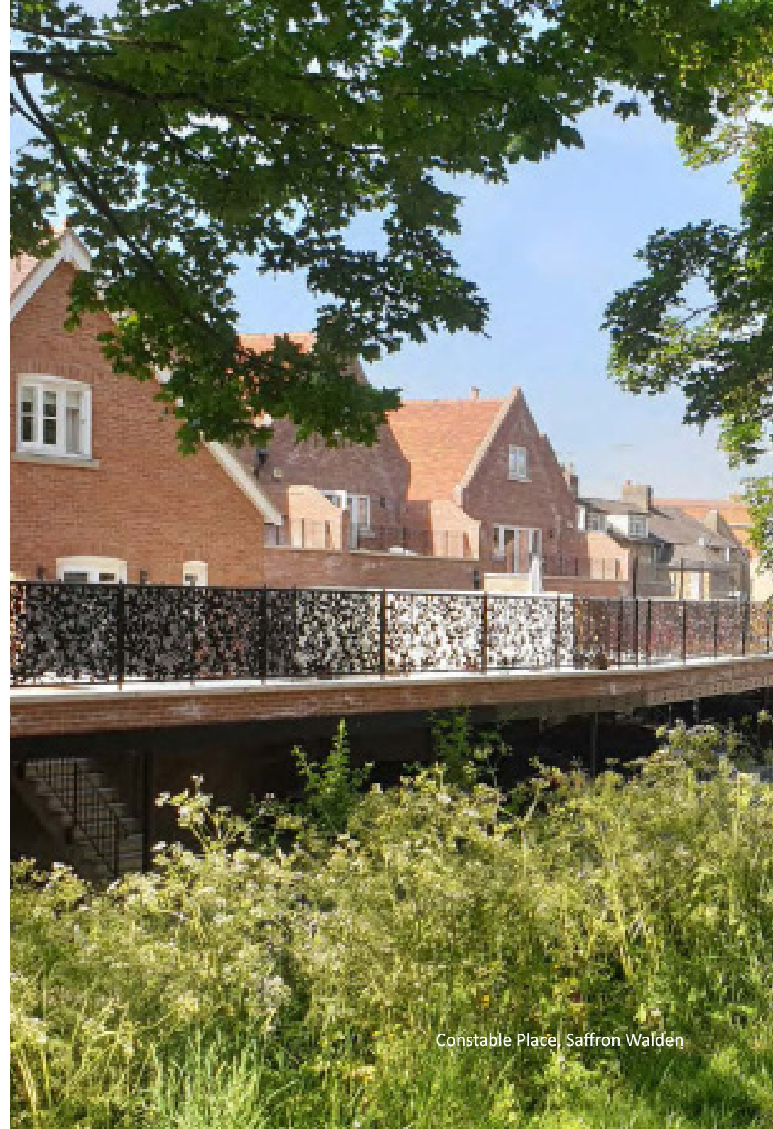
Constable Place, Saffron Walden

For the UQRP to succeed, it must be carried out using a robust, yet transparent and collaborative process. It must also offer consistently high standards in the quality of its advice. These standards can be summarised in the key eleven principles.