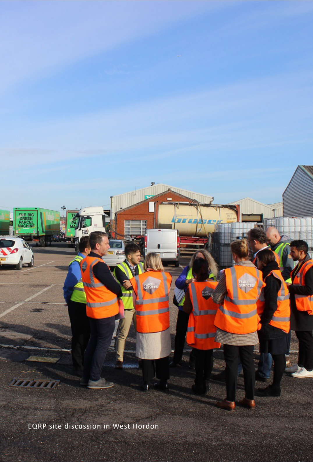
EQRP site discussion in West Hordon