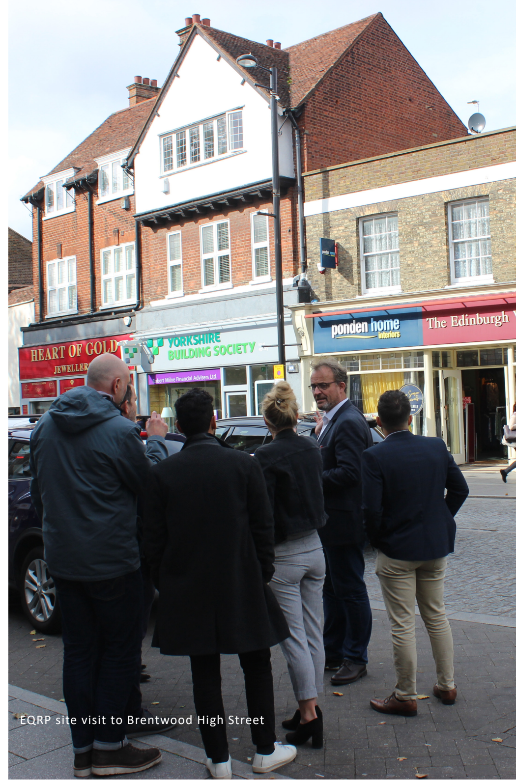
EQR site visit to Brentwood High Street

Following on from the applicant's presentation, there will be an opportunity for the members ask questions and any areas for further clarifications in turn, before proceeding onto the formal panel discussion, led by the Chair. Although the EQR encourages panel members to engage with each other's points in an exploratory manner, it is important that each member expresses his/her views on the project proposals in a very clear and concise manner, in order to aid a succinct written report of the discussions.